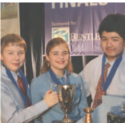
Future City Competition