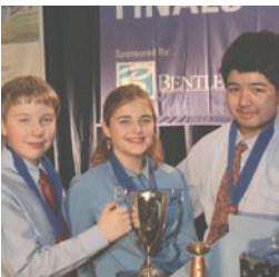
Future City Competition